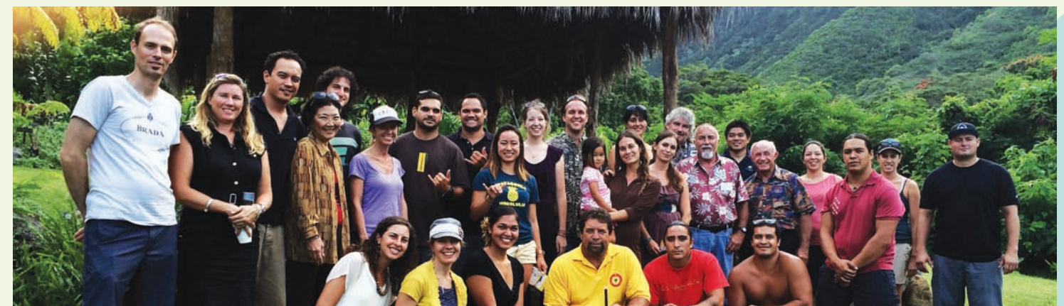
Members of the Hawai'i Green Growth cross-sector statewide team meet on Maui to discuss joint sustainability indicators for Hawai'i