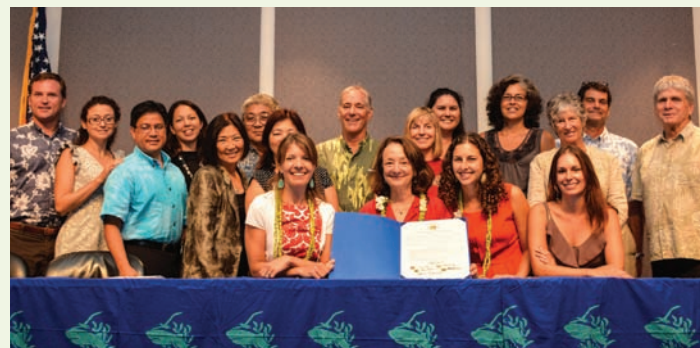
Hawai'i Green Growth public and private sector members celebrate the signing of the Aloha+ Challenge declaration

In 2014, the governor, all four mayors and the Office of Hawaiian Affairs launched the Aloha+ Challenge as a joint leadership commitment to sustainability for the State of Hawai'i. The Hawai'i State Legislature unanimously endorsed the Aloha+ Challenge by resolution earlier that year (SCR 69).